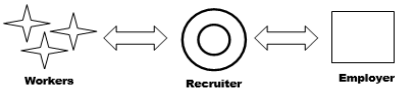
Figure 1: The Basic Recruiter-Employer Relationship

Although the core action of recruitment is captured in this simple diagram, the process of delivering people in one country to work in another often involves a chain of subcontracting arrangements. 125 As shown in Figure 2, a principal recruitment firm—which may be located in the destination or origin country, or both—may manage a network of sub-agents who stretch its