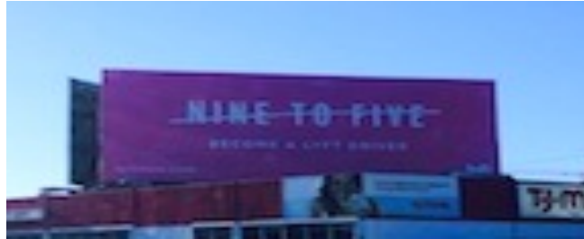
Image 1: On a billboard in San Francisco, Lyft advertises the potentials of flexible work: “ Nine to Five. ”

The ten-hour workday for taxi workers in San Francisco was accomplished through union representation. With unbridled competition, in order for a TNC driver or taxi worker in San Francisco to make a living wage in the post-union economy, he or she must work for longer.